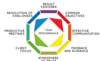
DYNAMIX® Team Performance Level 2

= INDIVIDUAL PERFORMANCE, TEAM EFFECTIVENESS, COLLECTIVE SUCCESS