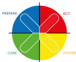
DYNAMIX® Personal Profile

“The overall concept of DYNAMIX® is very useful and I am confident that, with such a practical approach and facilitation, what I experienced could improve my Team Performance significantly once implemented!”