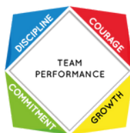
DYNAMIX® Team Performance Level 1