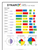
TEAM DIVERSITY GRID